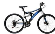
Basis 1 26" Full Sus Mountain Bike 18" Frame - Black/Blue